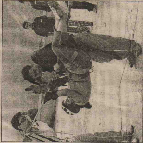
A student learning to rapple at SMIT rooftop.